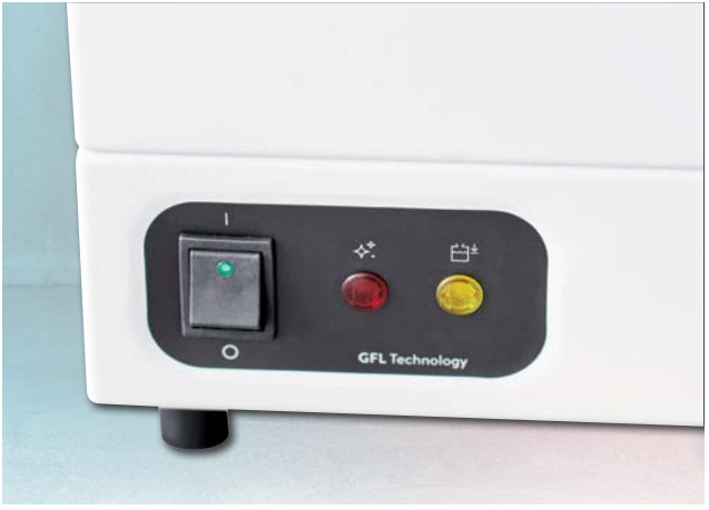
Our maxim is simplicity: LED indicators for operating status and cleaning requirement are equipped as standard