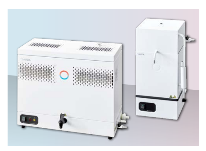
Equipped for any application: Puridest PD 4\ R with an internal storage tank and PD 2 for direct distillate extraction

Commissioning and operation of the stills are extremely simple. Ultra-pure water can be extracted directly after connection to the raw water and power supply. The only maintenance required is removing pollutants from the still. Dispensing with complex service work and cleaning as well as the repeated procurement of consumables makes LAUDA Puridest a simple and reliable solution that can be used anywhere in the world.